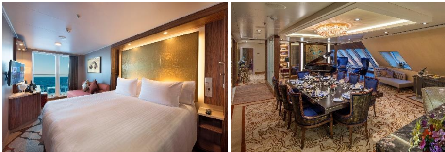
Fabulous prizes including an All-You-Can-Cruise Annual Pass to a Deluxe Balcony Stateroom (left) and a 2-night cruise vacation in Palace Villa, the luxurious duplex accommodations aboard Genting Dream(right) will be up for grabs.

A total of five prizes will be up for grabs, including the Grand Prize of an All-You-Can-Cruise Annual Pass to a Deluxe Balcony Stateroom that houses a maximum of four guests, worth about HK$3.8 million. The second prize is a two-night cruise vacation for up to six guests in a Palace Villa, the luxurious duplex accommodations aboard Genting Dream in The Palace, the exclusive “luxury ship-within-a-ship” concept of Dream Cruises, worth over HK$100,000.